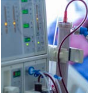
Miniature Air Bubble Sensor (MABS)