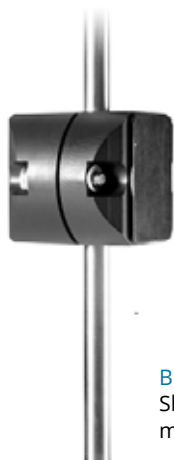
BDRI Sensor Shown with rigid, metal tubing in place

Introtek's BDRI Series integrated clamp-on sensor is designed to detect air-in-line and liquid level in rigid tubing.