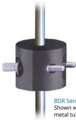
BDR Sensor Shown with rigid, metal tubing in place