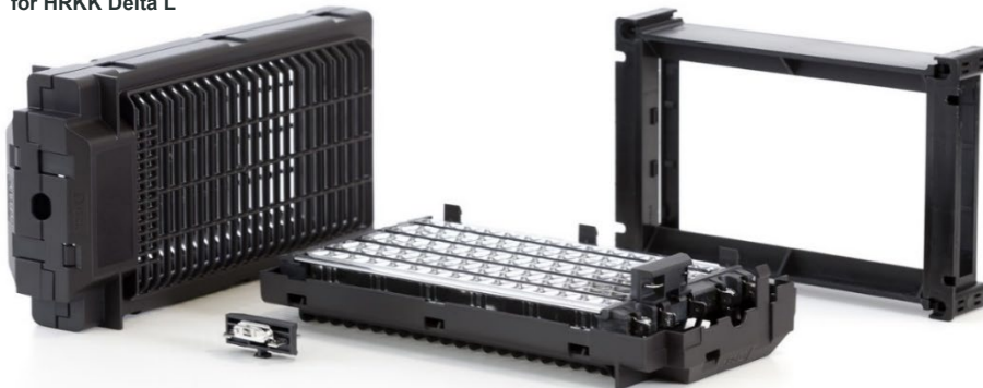
Temperature limiter with mounting clip

Enclosure with finger guard and connection cable available for HRKK Delta L