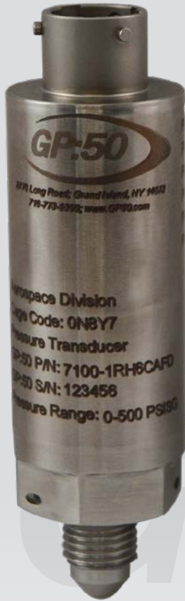
Model 7100 Flight Heritage Low Level Pressure Transducer