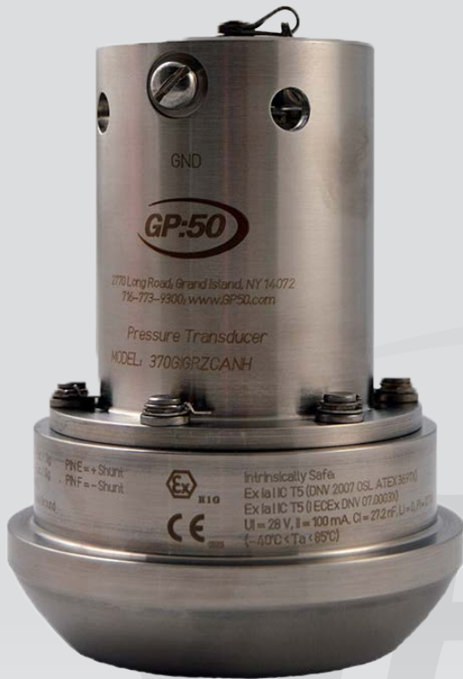
Model 170 / 270 / 370 WECO® "Hammer" Union Pressure Transmitter