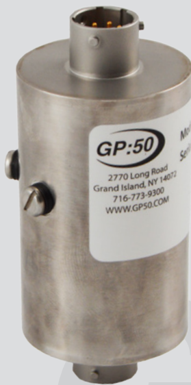
GP25 In Line Signal Conditioner, Amplifier