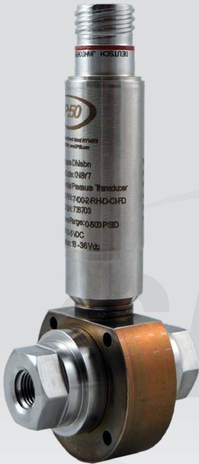
Model 7400 High Line Aerospace Differential Pressure Transducer