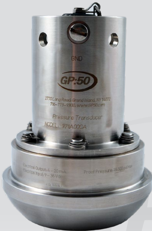
Model 271 / 371 WECO® "Hammer" Union Temperature Transducer